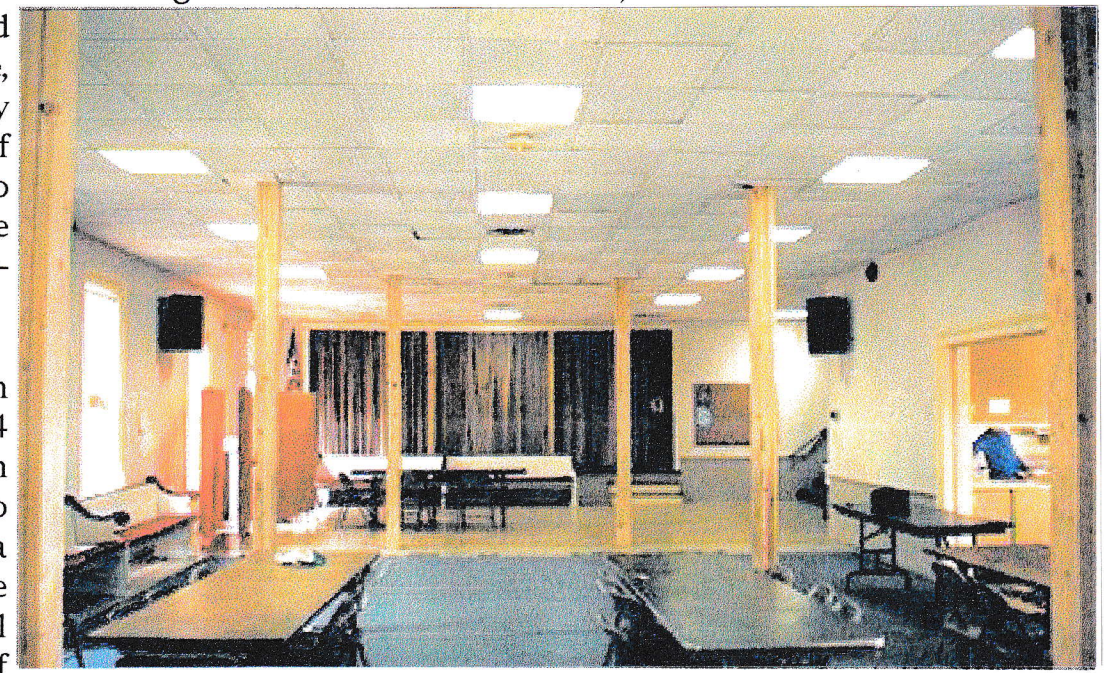
Fellowship Hall - Before

The Decision - In January of 1994 congregation the agreed to undertake a renovation of the Fellowship Hall and, in January of 1996 with floor plans in hand,