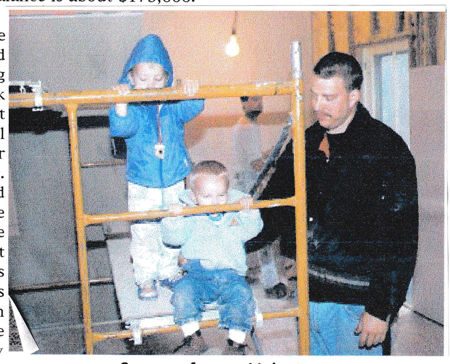
Some of our Volunteers

How You Can Help - We invite you to wander around the church to see what is going There may not be work underway on Sundays, but at almost any other time you will find workmen and/or volunteers doing something. Encouragement and admiration of the work are always welcomed. If you have an interest, and can invest some time, we certainly need as much volunteer help possible. There are times when organized work parties are underway. usually Thursday evenings and Saturday