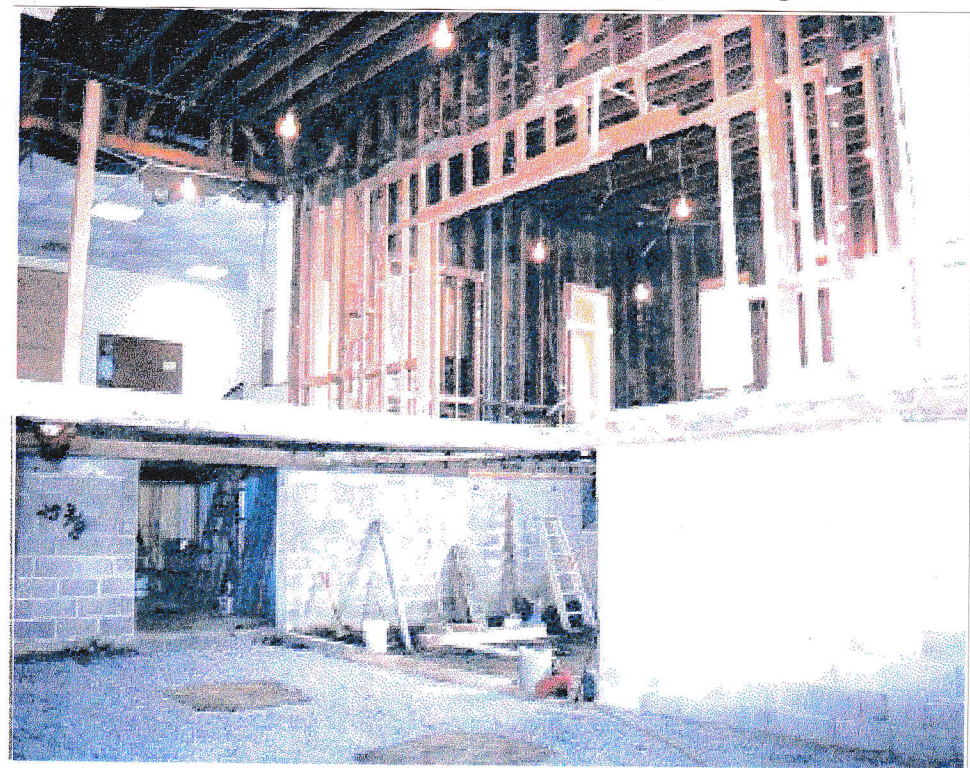
Fellowship Hall - During

Accomplishments - The project started in May of this year with the cleaning out of all of the rooms in the Fellowship Hall wing. Since then the work and progress has been steady - a full basement with usable rooms now exists under the Hall, and the basement area under the center wing is nearly at that stage. The new heating plant is in. and the new restrooms will be outfitted and functional within a few weeks. Work is now starting to finish the new rooms with ceilings, paint, and fixtures. handicap lift should also