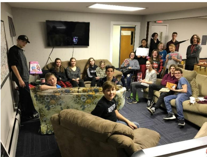
TAG Christmas Party - December 12 th , 2021

Our TAG youth group will be meeting on the following Sundays from 6:00-8:00: January 9th and January 23rd. Please keep all the teens of our group, and in Bergen, in your prayers. Continue to pray for God's protection and guidance in their lives!