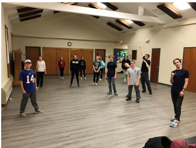
TAG - Nuke 'em!!!

Our TAG youth group will be meeting on the following Sundays from 6:00 PM-8:00 PM in the Teen Room: March 20th and April 3rd. Please keep all the teens of our group, and in Bergen, in your prayers. Continue to pray for God’s protection and guidance in their lives!