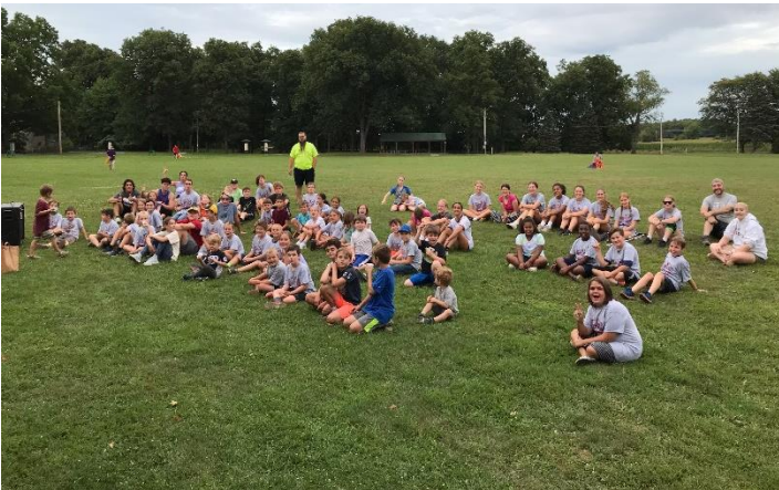
Bergen Sports Camp - 2023

Our TAG youth group will be meeting on the following Sundays from 6:00 PM-8:00 PM in the Teen Room: September 3rd and September 17th. Please keep all the teens of our group, and in Bergen, in your prayers. Continue to pray for God's protection and guidance in their lives!