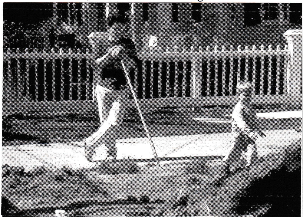
A Worker & A Supervisor

The recent good weather has allowed work to focus on work in the front yard of the church. Ditches needed for new services have been filled and the piles of dirt graded. Some fill and grading was also done in the rear of the church. Perhaps by the time