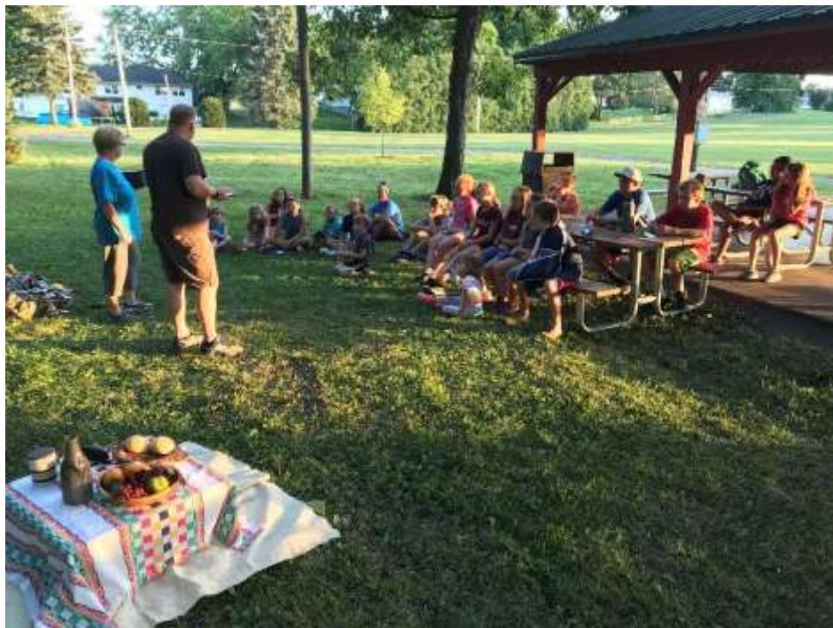
Remembering Hickory Park Summer Youth Gatherings 2020

Our TAG youth group will be meeting on the following Thursdays from 6:30-8:00: January 7th and January 21st. Please keep all the teens of our group, and in Bergen, in your prayers. Continue to pray for God's protection and guidance in their lives!