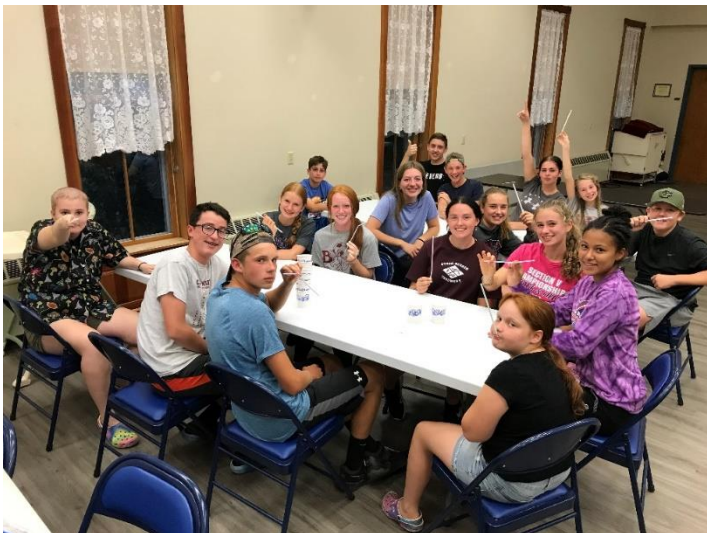
Marshmallow Olympics - September 17, 2023

Our TAG youth group will be meeting on the following Sundays from 6:00-8:00: October 1 st and October 15 th . Please keep all the teens of our group, and in Bergen, in your prayers. Continue to pray for God's protection and guidance in their lives!