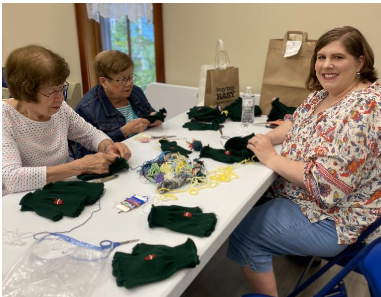
Attaching yarn to pairs of gloves