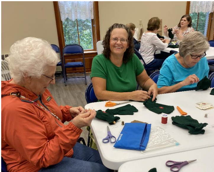
Attaching red rose for ladies' gloves