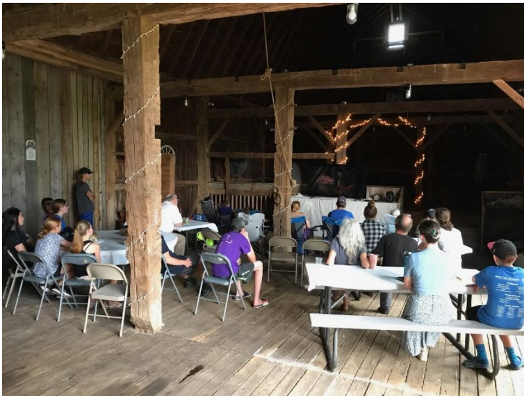
Teens and adults watching "The Chosen" in the Seward's barn - July 17, 2022

Our TAG youth group will be meeting on the following Sundays from 6:00-8:00: July 31 st , August 14 th , and August 28 th . Please keep all the teens of our group, and in Bergen, in your prayers. Continue to pray for God's protection and guidance in their lives!