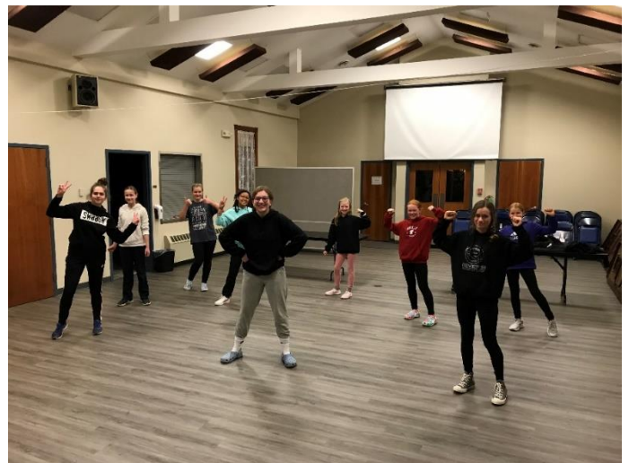
Girls Rule! TAG Nuke 'em Game - December 2021

Our TAG youth group will be meeting on the following Sundays from 6:00-8:00PM in the Teen Room. January 30 th , February 13 th , and February 27 th . Please keep all the teens of our group, and in Bergen, in your prayers. Continue to pray for God's protection and guidance in their lives!