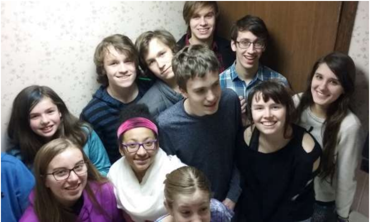
Remembering Youth Group Long Ago (Before Social Distancing). Yes...we were all hiding in the tiny bathroom downstairs! – May 2017

Our TAG youth group will be meeting on the following Thursdays from 6:00-7:30pm: May 27th, June 10th, and June 24th. Please keep all the teens of our group, and in Bergen, in your prayers. Continue to pray for God's protection and guidance in their lives!