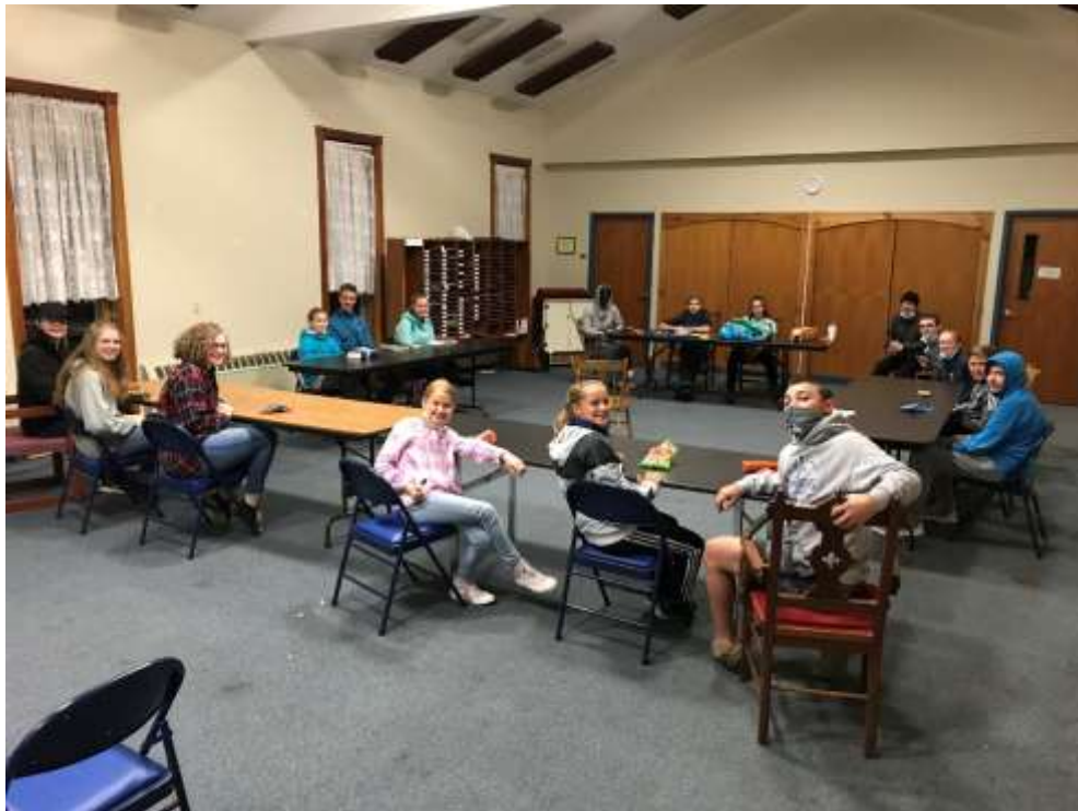
2020 Fellowship Hall TAG (Thankfully we are now back in the Teen Room!)

Our TAG youth group is switching from Thursday to Sunday evenings for the summer, since many of our teens have soccer, dance, karate, and other activities on Thursday evenings. Our Sunday night youth group will begin on Sunday, August 1 st . We will be meeting from 6:30-8:30PM in the Teen Room. We will also be holding more TAG social events this summer. The teens are excited about hiking ventures, bonfires, movie nights, etc. A Sunday morning teen bible study is also in the works, stay tuned for more details. Please keep all the teens of our group, and in Bergen, in your prayers. Continue to pray for God's protection and guidance in their lives!