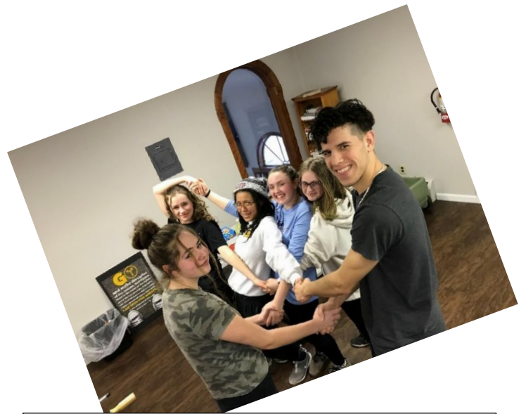
Winter Party!!! – March 6 th , 2022

Our TAG youth group will be meeting on the following Sundays from 6:00-8:00: April 3 rd and April 24 th . Please keep all the teens of our group, and in Bergen, in your prayers. Continue to pray for God’s protection and guidance in their lives!