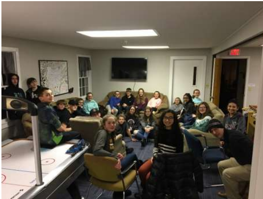
Final TAG Youth Group of 2020 Before Covid-19 Hit (in the Teen Room)

Our TAG youth group will most likely be switching from Thursday to Sunday evenings for the summer. Many of our teens have soccer, dance, karate, and other activities on Thursday evenings, so please stay tuned for updates on our night/time change. We will also be holding more TAG social events this summer. The teens are excited about hiking ventures, bonfires, movie nights, etc. Please keep all the teens of our group, and in Bergen, in your prayers. Continue to pray for God's protection and guidance in their lives!