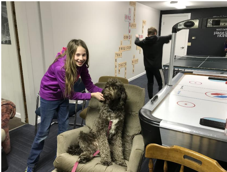
TAG Teens (and Special Guest)

Our TAG youth group will be meeting on the following Sundays from 6:00-8:00PM: March 3rd and March 17th. Please keep all the teens of our group, and in Bergen, in your prayers. Continue to pray for God’s protection and guidance in their lives!