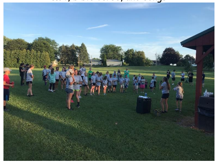
"Get in the game" Bible point, skit, bible verse, and songs

Pray for those who heard the Gospel, perhaps for the first time.