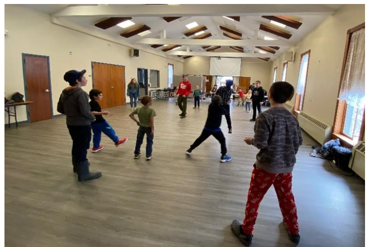
Just move the tables and chairs aside, and your fellowship hall has ample room for indoor PE on rainy days.