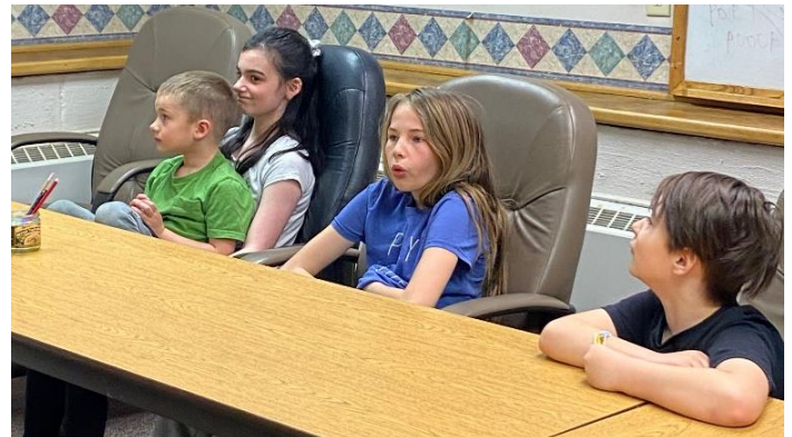
Four young children are learning musical notation and other principles of music theory in music class.