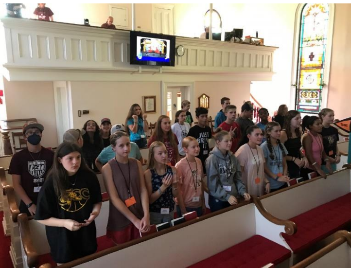
TAG Teens at VBS: 2022

Our TAG youth group will be meeting on the following Sundays from 6:00-8:00PM: May 7th, May 21st, and June 4th. Please keep all the teens of our group, and in Bergen, in your prayers. Continue to pray for God's protection and guidance in their lives!