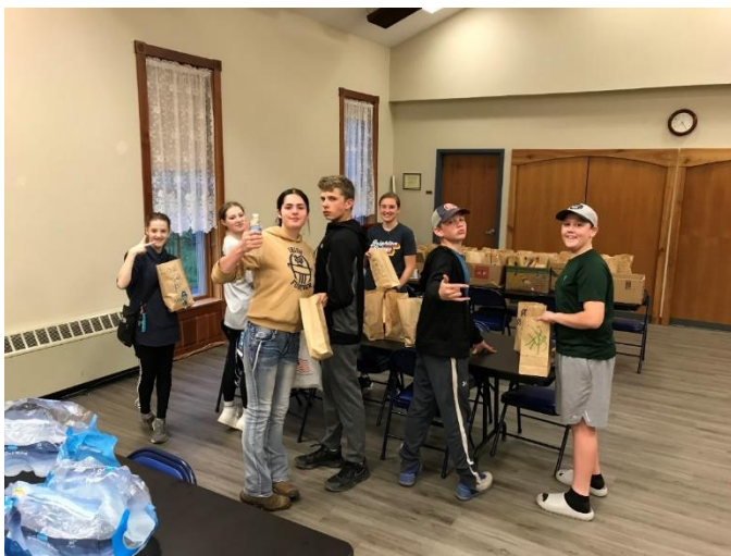
TAG Teens Packing PBJ Lunches for Open Door Mission – May 7, 2023

Our TAG youth group will be meeting on the following Sundays from 6:00-8:00PM: June 4th and June 18th. Please keep all the teens of our group, and in Bergen, in your prayers. Continue to pray for God's protection and guidance in their lives!