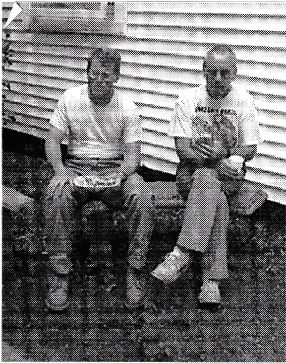
Lunch Break for a Couple of Hard-working Volunteers

the afternoon and evening we will be welcoming our congregation, friends, all those who have helped in this endeavor, and the entire community to a FREE COMMUNITY PIG ROAST in the parking lot. There will be a good meal with all the trimmings (and hot dogs for those who prefer), tours of the facility, and live music. More details will be coming as the day's events start coming together.