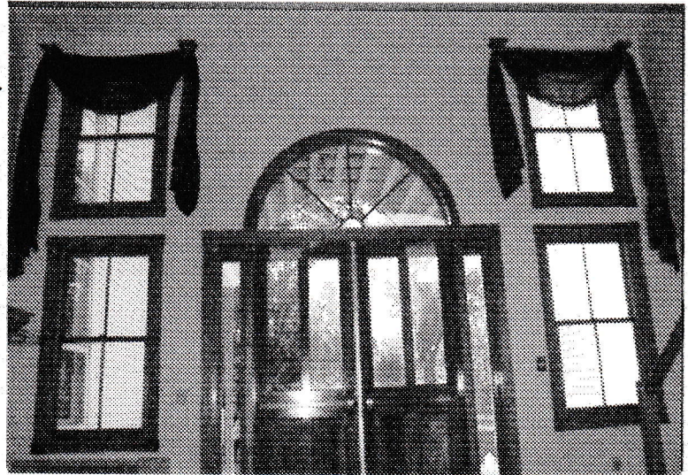
Front Windows with Curtains

RECENT PROGRESS: May and June have seen much progress towards finishing the project, with a lot of detailed work being completed. Particularly noticeable are the attractive blue curtains on the front windows of the new center entrance. The new hand rail and the banister posts for the stairs to the second floor have recently been installed also. More of the beautiful cherry wood