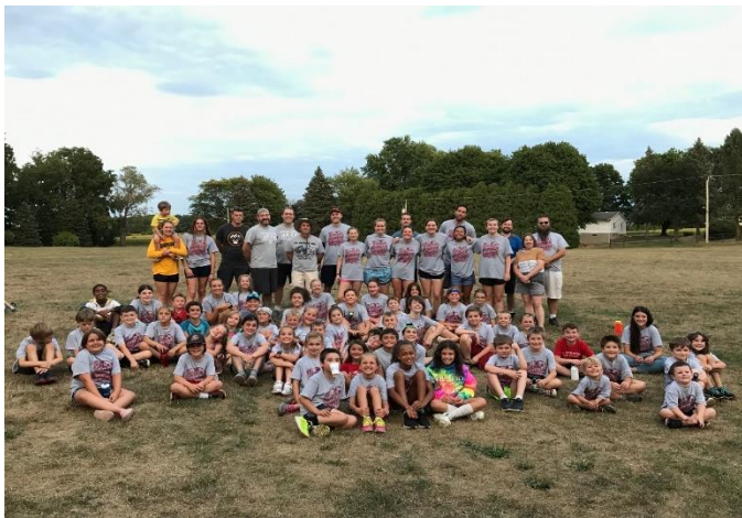
Christian Sports Camp 2022: Thank you to all teen and adult volunteers!

Our TAG youth group will begin meeting again as usual on September 3 rd , from 6:00 - 8:00PM in the church teen room. Please keep all the teens of our group, and in Bergen, in your prayers. Continue to pray for God's protection and guidance in their lives!