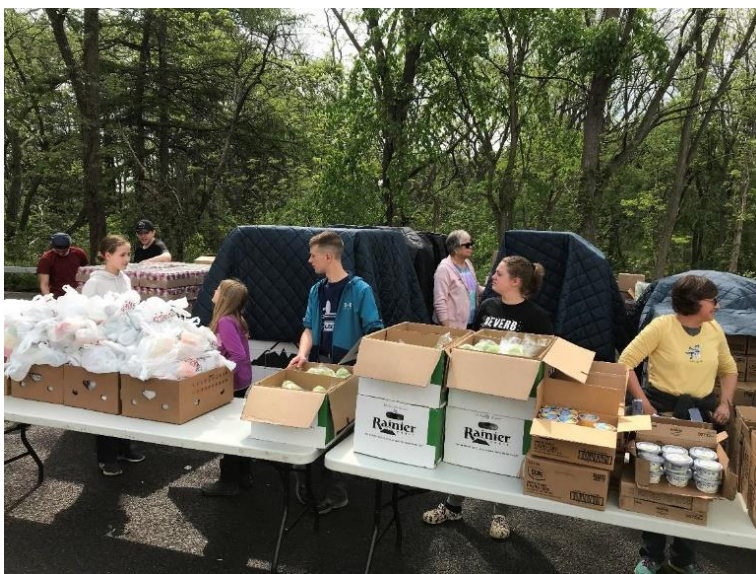
Teens Helping at Foodlink – June 16, 2022

Our TAG youth group will be meeting on the following Sundays from 6:00-8:00PM: July 3rd, July 17th, and July 31st. Please keep all the teens of our group, and in Bergen, in your prayers. Continue to pray for God's protection and guidance in their lives!