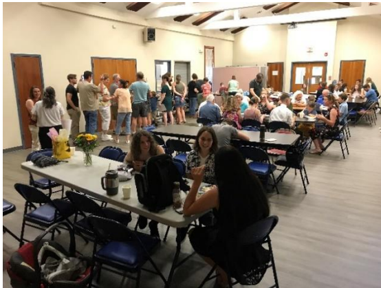
Baccalaureate Celebration – June 2, 2023