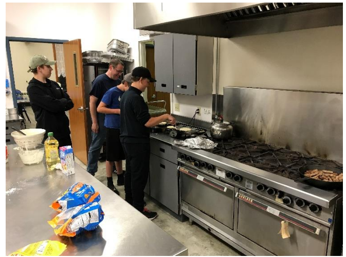
Men’s Breakfast Preparation – June 15, 2023

Our TAG youth group will be meeting on the following Sundays from 6:00-8:00PM: July 2nd and July 16th. Please keep all the teens of our group, and in Bergen, in your prayers. Continue to pray for God’s protection and guidance in their lives!