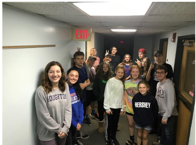
Teens preparing for "Hide and Seek" - September 25, 2022

Our TAG youth group will be meeting on the following Sundays from 6:00-8:00: October 9 th and October 23 rd . Please keep all the teens of our group, and in Bergen, in your prayers. Continue to pray for God's protection and guidance in their lives!