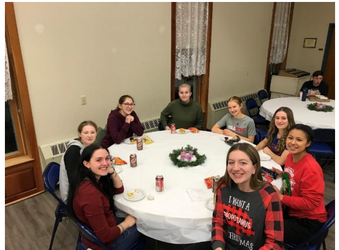
TAG Teens Enjoying a Pizza Party at our 2023 Christmas Celebration

Our TAG youth group will be meeting on the following Sundays from 6:00-8:00PM: January 28 th , February 11 th , and February 25 th . Please keep all the teens of our group, and in Bergen, in your prayers. Continue to pray for God's protection and guidance in their lives!