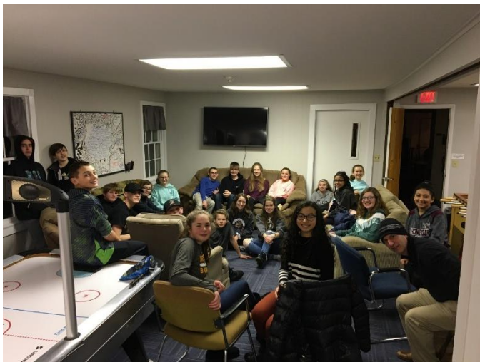
Looking Back... - January 9, 2020 TAG Group

Our TAG youth group will be meeting on the following Sundays from 6:00-8:00: November 19 th and December 3 rd . Please keep all the teens of our group, and in Bergen, in your prayers. Continue to pray for God's protection and guidance in their lives!