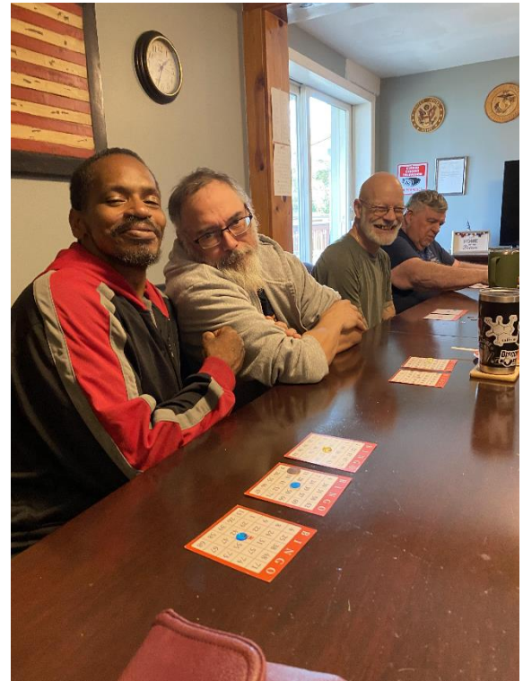
Veterans at Eagle Star