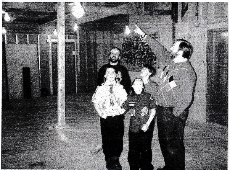
The Scouts Get a Tour

The Renovation Fund Drive is coming along well, with 32 pledges totaling over $160,000 received to date. Actual pledge receipts total $93,000, with over $17,000 in cash and about $76,000 in stocks or other equities. We are well on our way to our goal of $300,000 in total pledges.