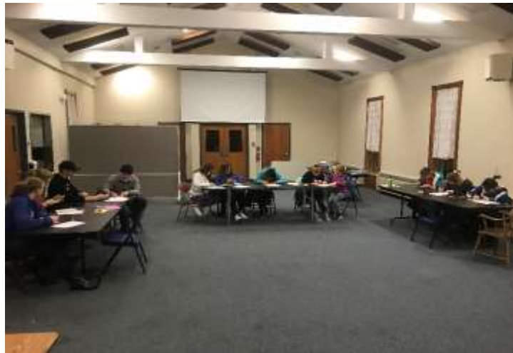
Teens Writing Encouraging Cards for Recovering Addicts – February 2021

Our TAG youth group will be meeting on the following Thursdays from 6:00-7:30: March 4th and March 18th. Please keep all the teens of our group, and in Bergen, in your prayers. Continue to pray for God’s protection and guidance in their lives!