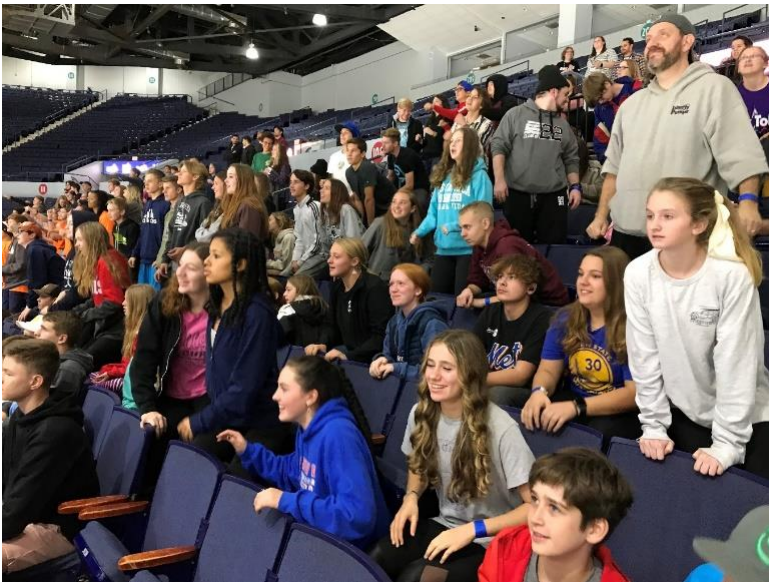
TAG Teens and Volunteers at a Rochester Americans Hockey Game

Our TAG youth group will be meeting on the following Sundays from 6:00-8:00PM: January 29th, February 19th, and March 5th. Please keep all the teens of our group, and in Bergen, in your prayers. Continue to pray for God's protection and guidance in their lives!