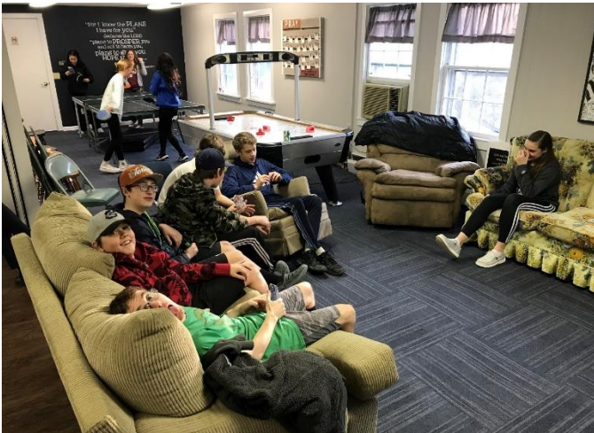
TAG Teens Fellowship: March 19, 2023

TAG teens are growing and maturing in their faith and understanding of God's plan for their lives each youth group. We are continuing our trek through the book of Luke during our time of bible reading and reflection each week. We read and discussed Luke Chapter 6 verses 1-11 at our most recent meeting. In these verses Jesus has "discussions" with the pharisees pertaining to the Jewish laws regarding Sabbath. Each week I challenge the teens to come up with an application of the scripture read, which is relevant to them in their own life. What the teens took away from our evening reflection on March 19th is that regardless of the circumstances always do what is right and true and pure in the eyes of God!