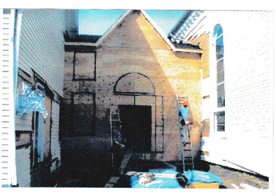
The New Front Entry

PRIORITIES: For the next several weeks, the renovation project will need to focus on completing the new spaces and rooms to make them fully