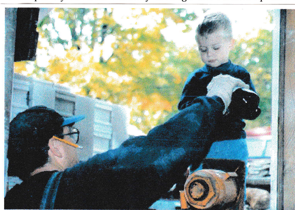
Everyone Deserves a Pop Break

operational and as comfortable as possible. Walls need to be put up and finished, hardware installed, restrooms made functional, etc. For this reason, a schedule for the rebuilding of the Fellowship Hall roof structure has not been set, but it will probably begin after Christmas. Similarly, the expansion of the front hall and entry into the new space and building of the new stairs to the second floor and basement will be scheduled for late this year or early 1997. Once the Fellowship Hall structural work is done, we can finish off that room and begin to finish and equip the kitchen. There are plans to build a temporary covered walkway through the Fellowship Hall from the right rear entrance