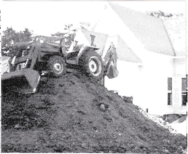
Some of the Excavated Earth

Most recently, installation of the new heating plant has begun in the basement. This new system replaces the old one we had and will very efficiently meet the air heating and handling needs of the entire church building, including the sanctuary. Our thanks to Bill Bliss for stepping forward to provide his knowledge and resources for this integral part of the new facility, and at a very favorable cost to the church.