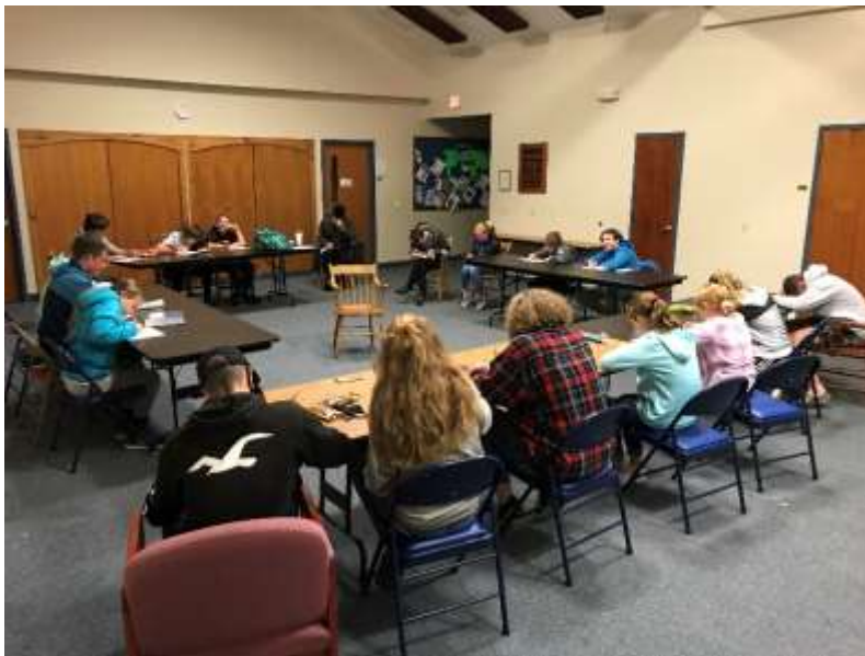
Teens spending time reflecting on their 2020 blessings – January 2021

TAG (Youth Group) continues to be a great blessing to all involved, and has been very well attended since we began meeting in-person again. We have new teens showing up almost weekly, and God continues to do a great work through the Bergen Evangelical Presbyterian Church and our teen program. We recently had two teens attend TAG who stated that they did not necessarily believe in God, but came because they were invited by a friend. Both of the teens returned for our most recent youth group. During youth group that night, one of them asked for prayer for teens who live in toxic homes, and the other teen is now attending Cornerstone Christian Academy in Brockport. God is Good! COVID-19 protocols and procedures, similar to those in schools, are in place to keep everyone safe and healthy. We practice social distancing and wear masks when not seated six feet apart. We are also asking any teens (or families) who are sick, or exhibiting any Covid-19 symptoms, to please stay home. Our TAG youth group will be meeting on the following Thursdays from 6:00-7:30: February 4th and February 18th. Please keep all the teens of our group, and in Bergen, in your prayers. Continue to pray for God's protection and guidance in their lives!